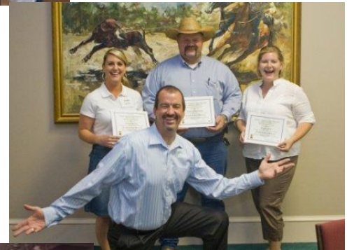
Young Cattlemen's Leadership Workshop Masters of Beef Advocacy Graduates