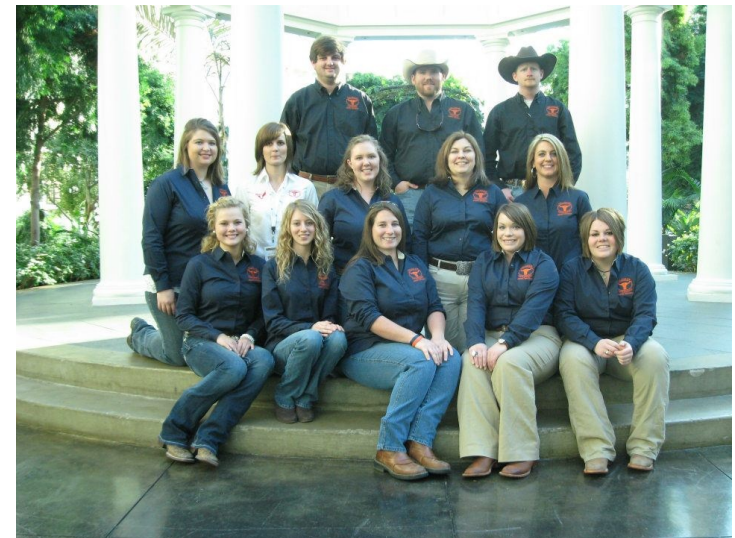
Auburn Collegiate Cattlewomen 2012 NCBA Cattle Industry and Trade Show Nashville, Tennessee