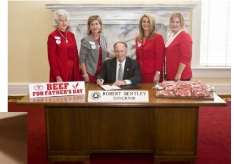
Beef for Father's Day Proclamation Signing