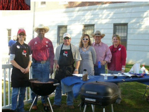
UA Tailgating Beef Demo