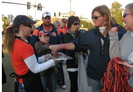
AU Tailgating Beef Demo